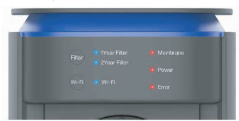
Figure 1. Smart RO unit LED indicators